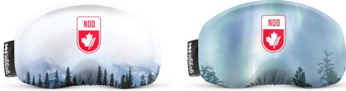
NOD GoggleSoc - $15